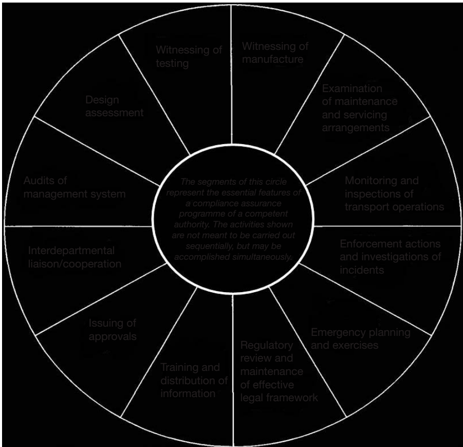
FIG. I-1. The compliance assurance circle.